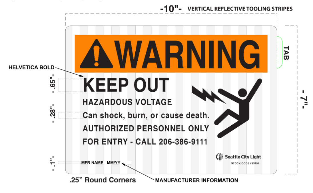
Figure 4. Example Sign Layout