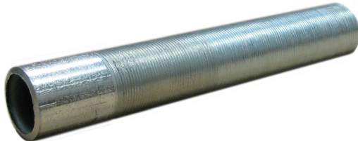
Figure 4.5. Nipple Stock