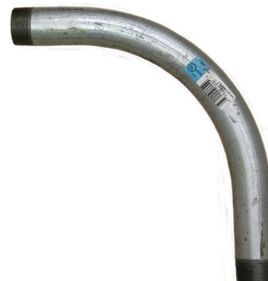
Table 4.3c. Large Sweep Elbows