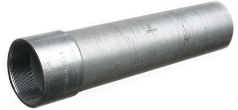
Table 4.2. Conduit

Each straight conduit section shall be finished with one threaded coupling attached.