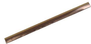
Adhesive-backed copper strips