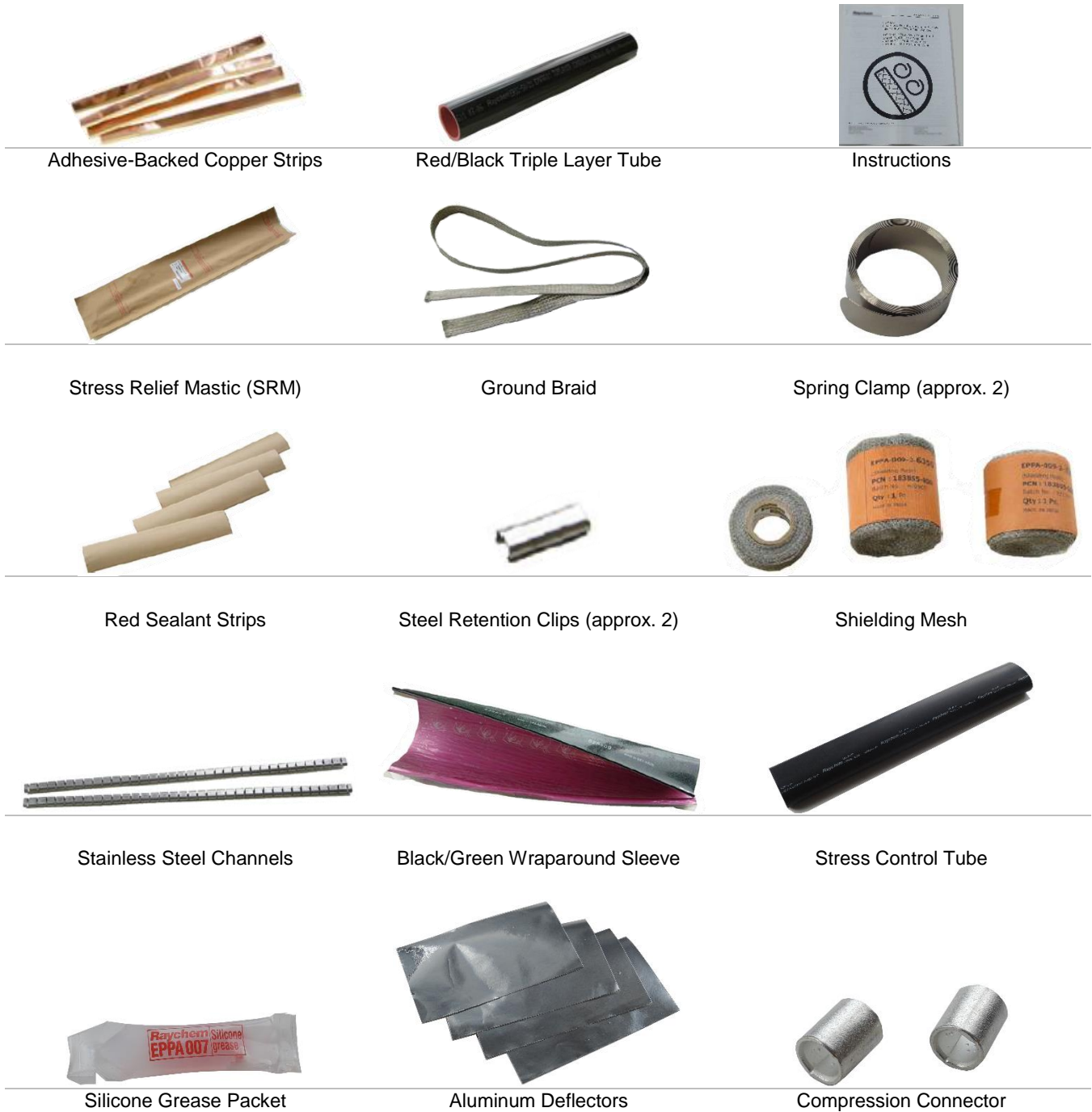
Table 4c. Heat-Shrink Splice Kit Components (Typical)