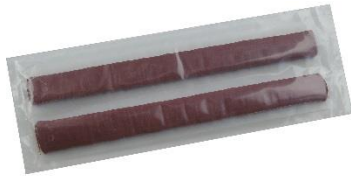
Red sealant strips