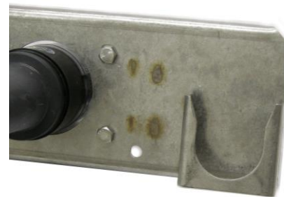
Figure 4.1, type 160PS parking stand