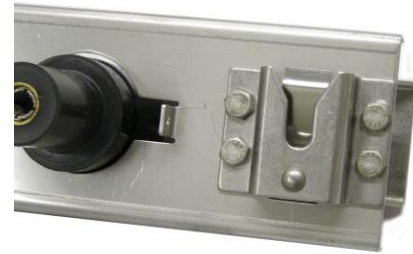
Figure 4.0, type 151PS parking stand

For the purposes of this Material Standard, parking stands designed for use with Elastimold type 151 grounding and insulated parking bushings shall be designated type 151PS . Parking stands of this design have a nominal horizontal opening of 3/8 inch. Parking stands designed for use with Elastimold type 160 grounding and insulated parking bushings shall be designated type 160PS . Parking stands of this design have a nominal horizontal opening of 2 inches. IEEE 386 does not differentiate between type 151PS and 160PS parking stands.