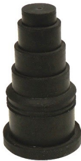
Figure 4.5. Streetlight Tap Cover

Streetlight tap covers shall have a nominal height of 2-1/2 inches.