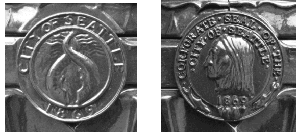
Figure 4.5. Medallions

Like designs shall be installed on faces opposite from each other.