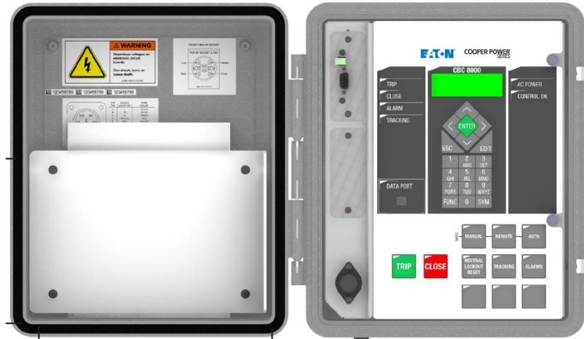
Figure 4.3. Control Unit