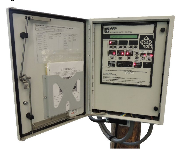
Figure 4.3. Control Unit