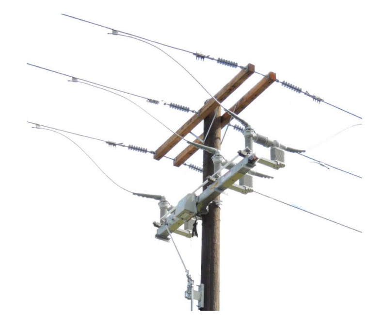
Figure 4.2a. Load Interrupter Switch, Horizontal