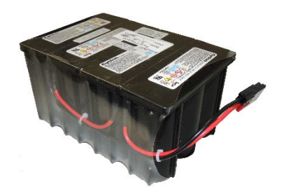
Figure 4.4. Battery Pack, 24 Vdc, 8 Ah