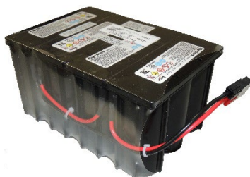
Figure 4.4. Battery Pack, 24 Vdc, 8 Ah