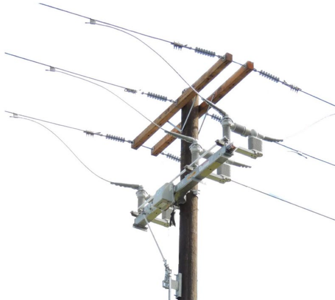
Figure 4.2a. Load Interrupter Switch, Horizontal