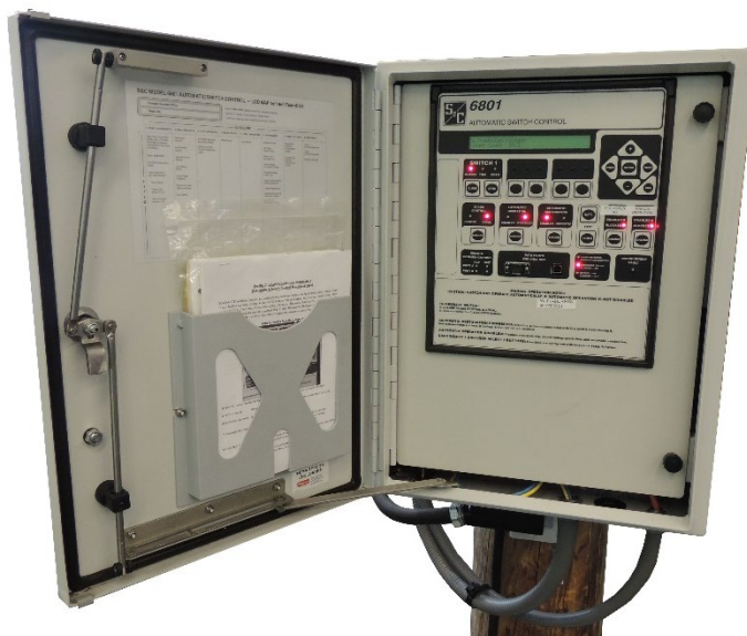
Figure 4.3. Control Unit