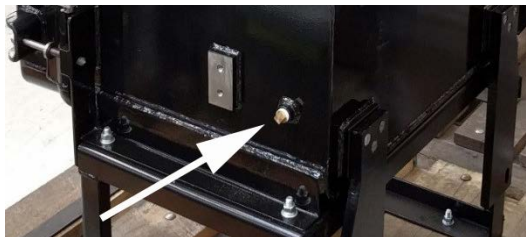
Figure 5.2. Penetration on Right Hand Side for Future Use

One hole with an NPT threaded tap and plug, 1/2 inch in diameter, shall be provided on the right hand side of the bus tie switch case for future use. The hole shall be located on the side wall of the bus tie switch case (not the door side or the wall side), 6 inches up from the bottom of the case and 3 inches from the wall side. See Figure 5.2.