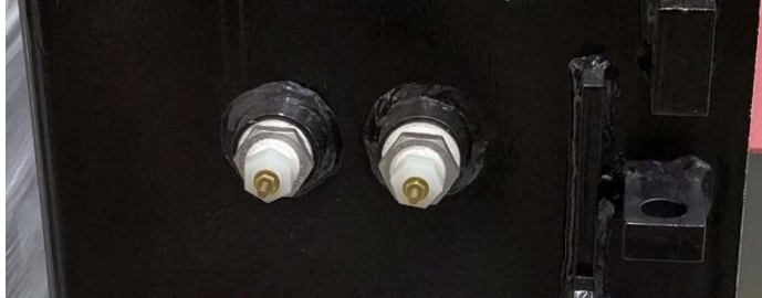
Figure 5.3. Spark Plug Bushings

One "b" stage on the auxiliary switch shall be wired to a terminal block.