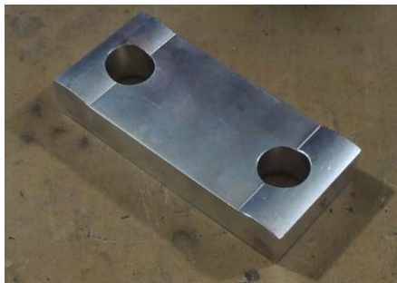
Figure 5.6. Copper Link Example