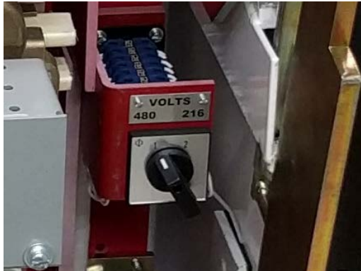
Figure 5.5. Voltage selection switch

Each bus tie switch shall be supplied with a voltage selection switch. See Figure 5.5.