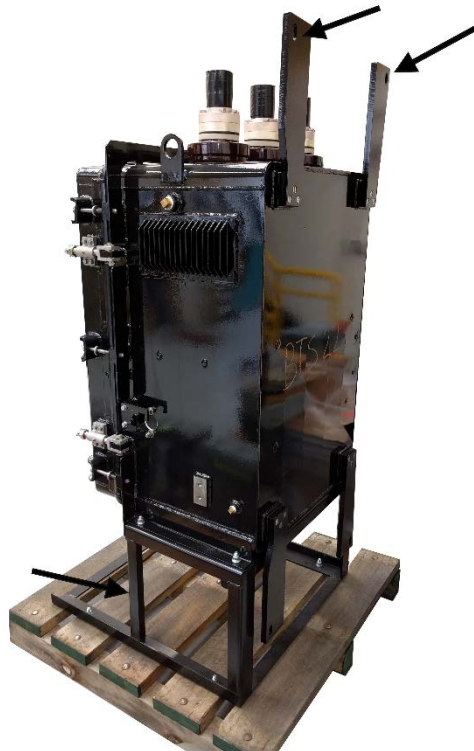
Figure 5. Bus Tie Switch Mounting Holes and Feet

The bus tie switches shall be suitable for wall mounting without the removal of any external housing components. A 13/16-in diameter mounting hole shall be provided at each of the four rear corners of the protector. The mounting holes shall be accessible from the front and not covered or blocked by the cable bushings or other accessories. The bus tie switches shall have removable feet capable of supporting the weight of the protector and providing 9 inches of clearance between the studs and the floor. See Figure 5.