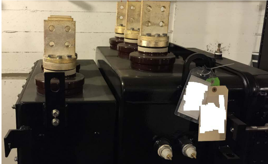
Figure 5.7. Bus Tie Switch with Top-Mounted Line Side Spades

For stock numbers 335605 and 335607, spades rated to carry the current listed shall be supplied for the line and load side connections. The line side connections shall be installed on the back and top of the switch. See Figure 5.7.