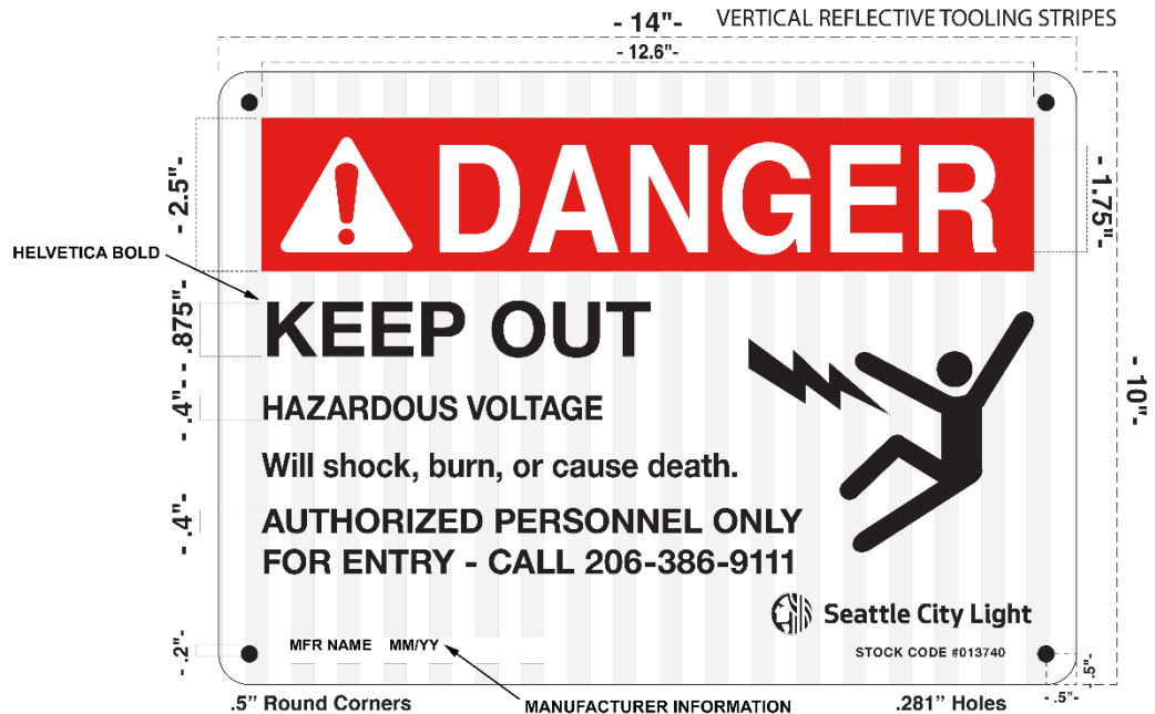
Figure 4. Example Sign Layout