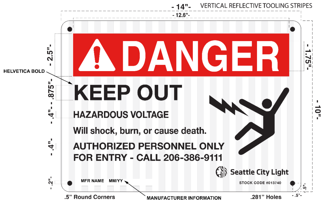
Figure 4. Example Sign Layout