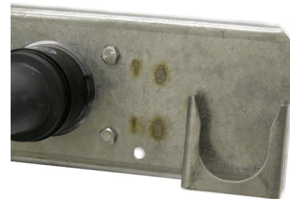
Figure 4.1, type 160PS parking stand