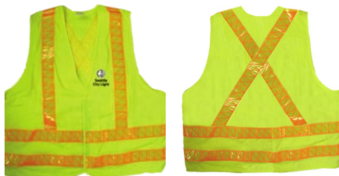
Figure 4.1. Front and Back of Safety Vest

Garment design shall follow ANSI/ISEA 107-2015, Appendix C - Examples of Garment Designs, Figure C-6, Vest Pattern 3 and Figure 4.1.