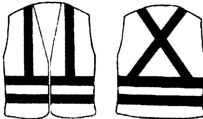
Figure 4.4. Vest Pattern 3 (Performance Class 2), ANSI/ISEA 107-2015

Retroreflective tape shall be FR rated, with the following attributes: