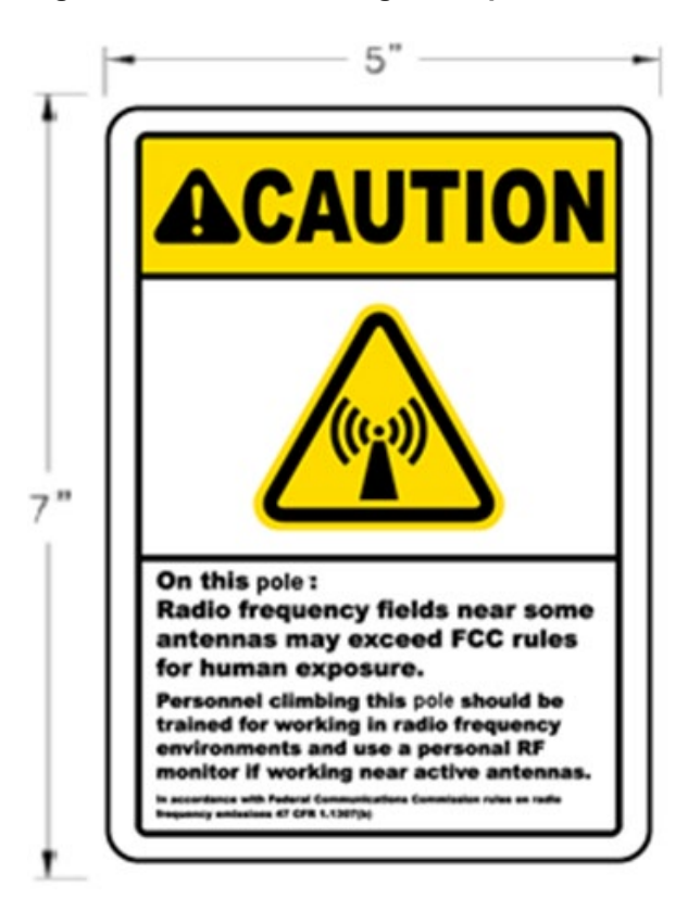
Figure 3.2. RF Caution Tag, Example

Superseding: March 27, 2020 Effective Date: July 22, 2020 Page: 4 of 6