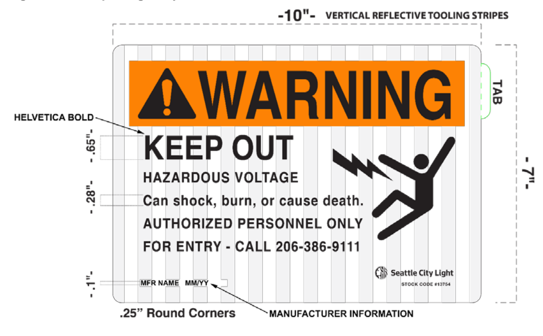
Figure 4. Example Sign Layout