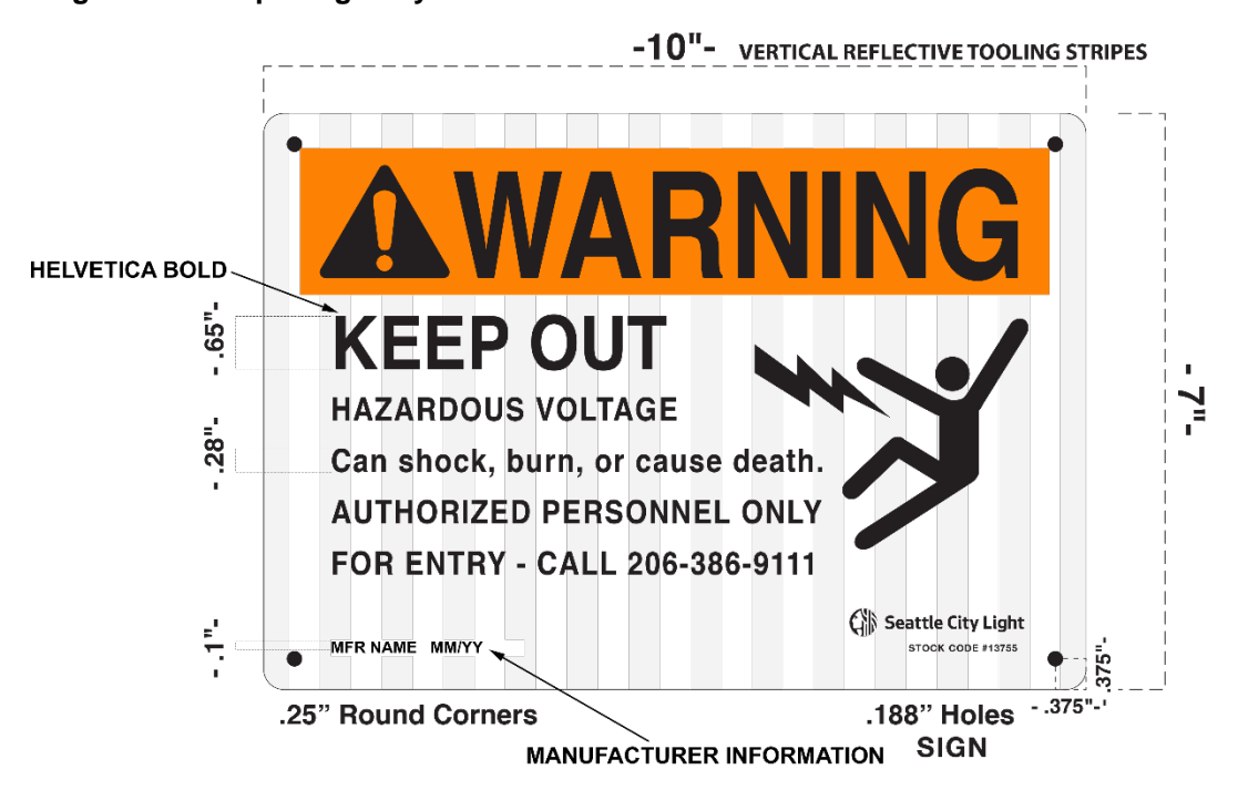
Figure 4. Example Sign Layout