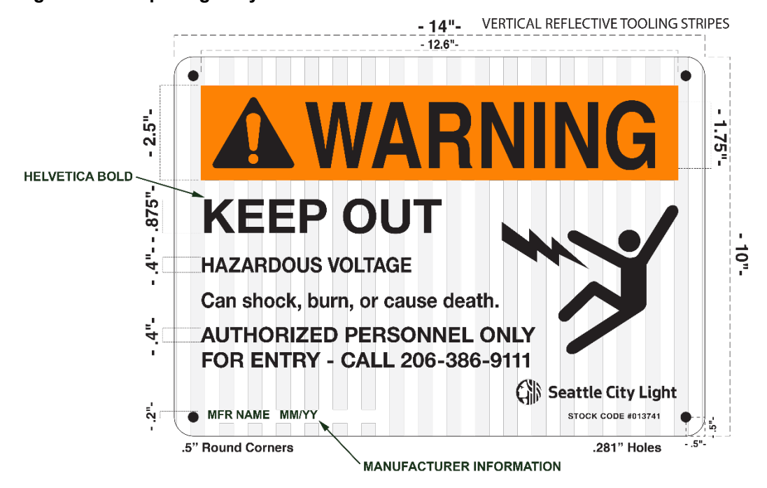
Figure 4. Example Sign Layout