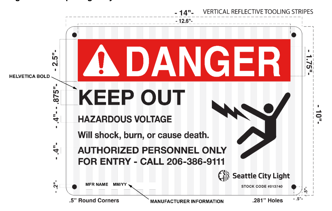
Figure 4. Example Sign Layout