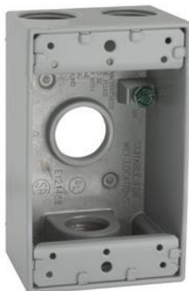
Figure 4.6. Weatherproof Duplex Outlet Box