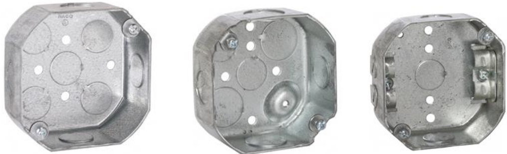
Table 4.1. Octagonal Box Dimensions