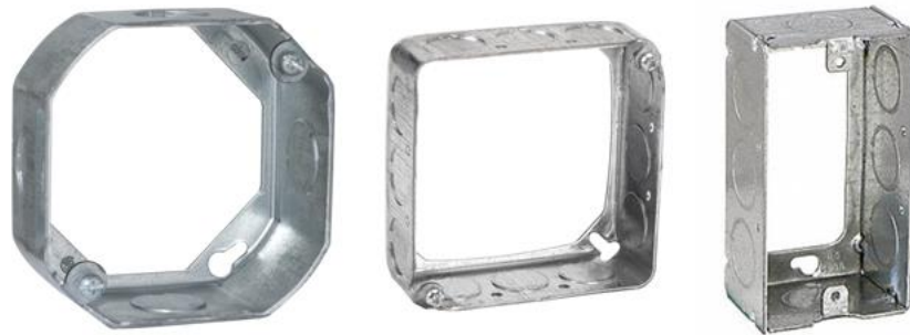
Table 4.5. Box Extension Dimensions