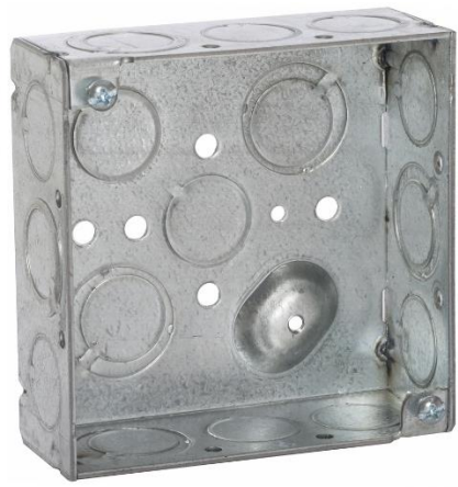
Table 4.2. Square Box Dimensions