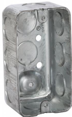
Table 4.4. Utility Box Dimensions