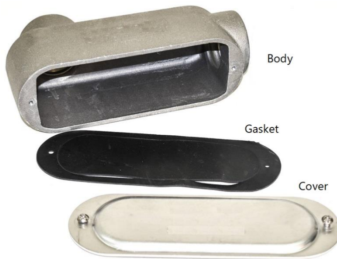
Figure 4. Conduit Body Assembly