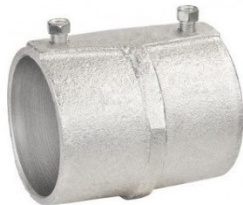
Figure 4. Set Screw Coupling