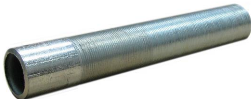
Figure 4.5. Nipple Stock