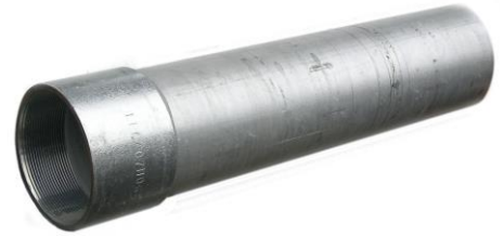
Table 4.2. Conduit

Each straight conduit section shall be finished with one threaded coupling attached.