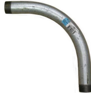
Table 4.3c. Large Sweep Elbows