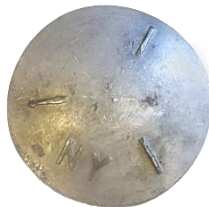
Figure 5. Example of Pin Head Grade or Type Symbol