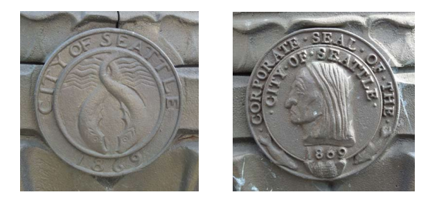
Figure 4.5. Medallions

Like designs shall be installed on faces opposite from each other.