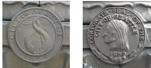
Figure 4.5, Medallions

Like designs shall be installed on faces opposite from each other.