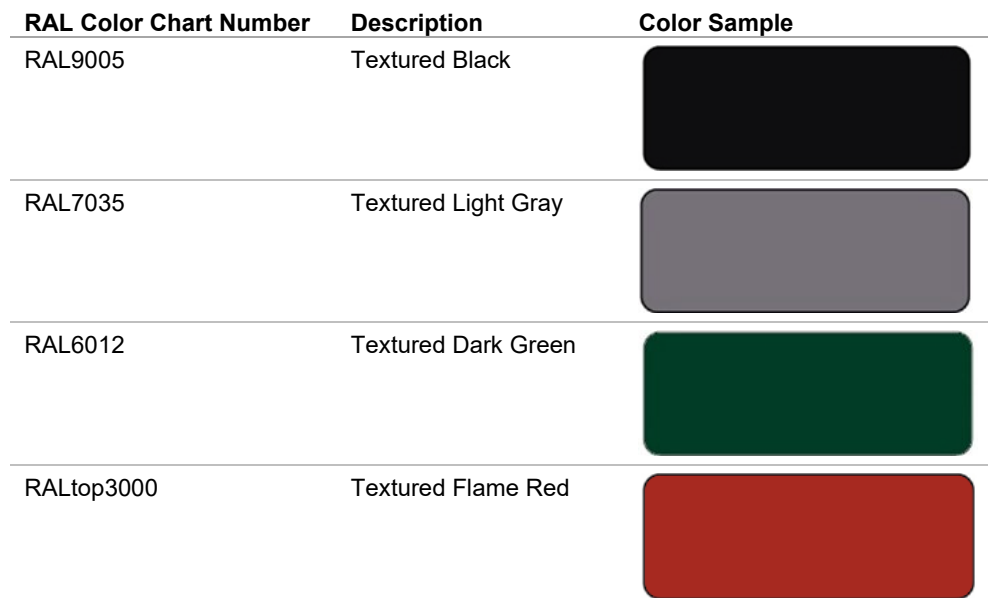
Figure 4.7. Color Choices

Seattle City Light uses the color choices shown in Figure 4.7: