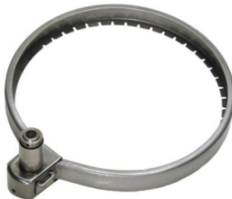
Figure 4.2.2. Barrel Lock Sealing Socket Ring