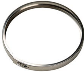
Figure 4.2.1. Snap Sealing Socket Ring

No key or tools shall be required for installation.