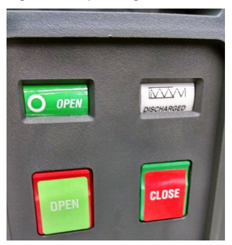
Figure 5.5. Operating Buttons

Buttons for operating network protector shall be permanently labeled and color coded. If sticker-type labels are used, additional phenolic nameplates shall be supplied below the buttons. See Figure 5.5.