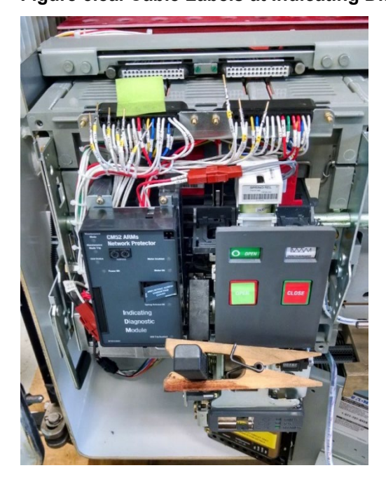
Figure 5.8a. Cable Labels at Indicating Diagnostic Module

Cables shall be labeled and routed at Indicating Diagnostic Module to insure correct phase rotation. See Figure 5.8a.