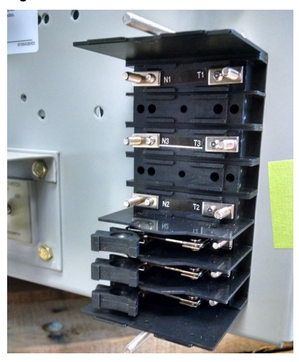
Figure 5.8b. Labels at Terminal Block

Cables and terminal block shall be labeled to ensure correct phase rotation. See Figure 5.8b.