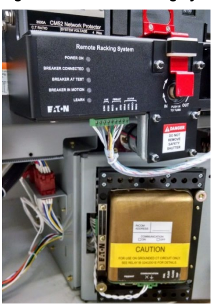
Figure 5.7. Remote Racking System Cables

Labels shall be provided on the remote racking system and stack light fuses.