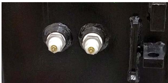
Figure 5.4. Spark Plug Bushings

One "b" stage on the auxiliary switch will be wired in series between the network side of the breaker and the spark plug bushing in the throat of the transformer by Seattle City Light. The manufacturer shall supply a coil of wire of sufficient length to make this connection. One end of the coil shall be connected to the "b" stage of the auxiliary switch.