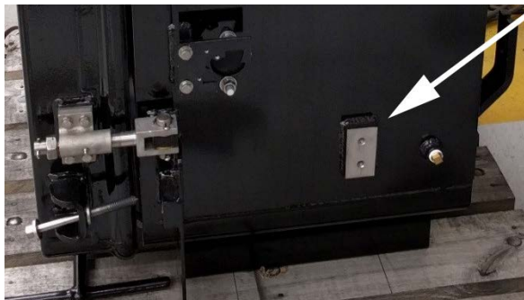
Figure 5.2. Network Protector with Exterior Ground Pad

Ground pad shall be installed on the lower portion of the protector right side wall. See Figure 5.2.