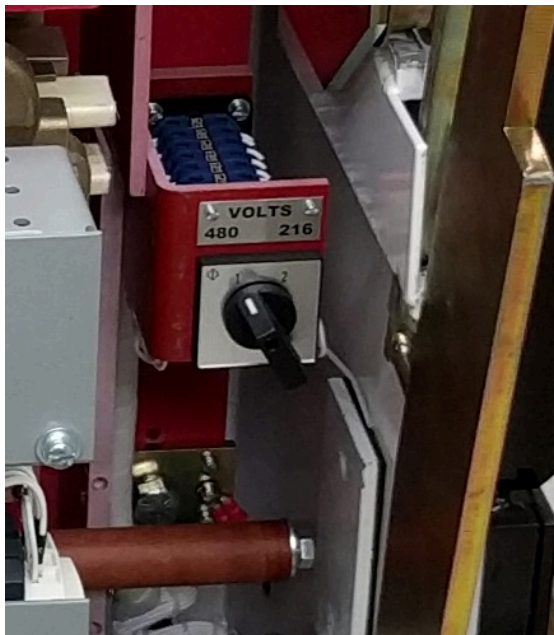
Figure 5.6. Voltage Selection Switch

Each network protector will be supplied with a voltage selection switch. See Figure 5.6.