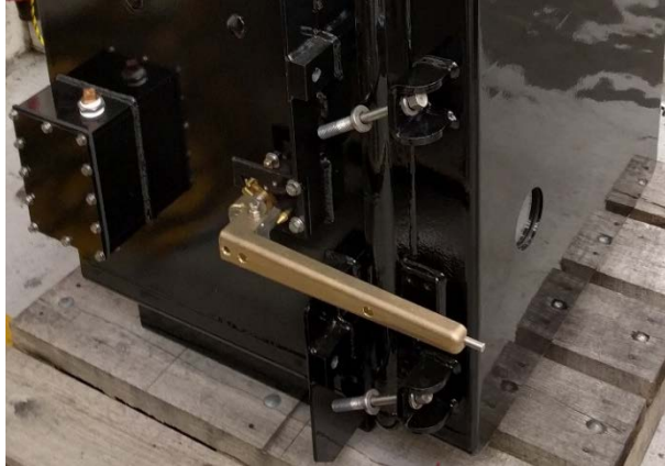
Figure 5.5. Junction Box on NP Left Hand Side

The external terminals of the waterproof connectors that penetrate the case shall be covered by a welded-on waterproof junction box with two-3/4 inch threaded taps and plugs, one tap and plug located on the top of the junction box and the other tap and plug on the bottom of the box. The four trip and lockout terminals shall be labeled. See Figure 5.5.