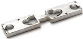
Figure 13c. Z-Type Fuse