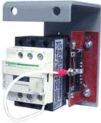
Figure 13a. Motor Relay Assembly with Bracket