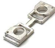
Figure 13b. Y-Type Fuse