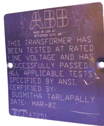
Figure 7.9, Test tag, example