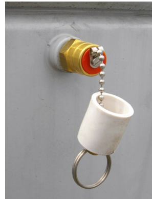
Figure 6.7 , Pressure relief valve

A pressure relief valve shall be provided per SCL 4480.10 and IEEE C57.12.20, Section 7.2.5.1 with the following clarifications: